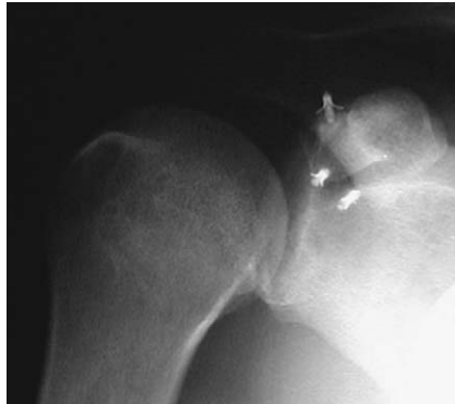
Fig. 3. Suture anchor loose within glenohumeral joint after treatment for shoulder instability.

terior glenoid osteotomy for recurrent posterior instability [31]. If a glenoid osteotomy is necessary, the cut should be made 6 [32] to 10 mm [33] from the articular margin. Bone block procedures have also been associated with the development of osteoarthritis [34,35], probably as a result of impingement on the articular cartilage.