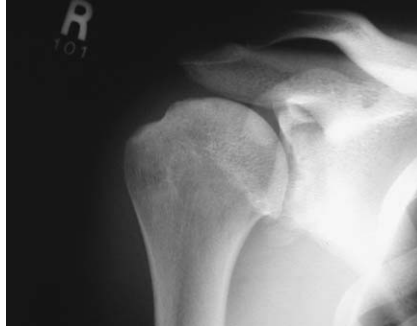
Fig. 1. Osteoarthritis in shoulder of patient with a history of shoulder dislocation.

did not find a significant correlation between the severity of arthrosis and the number of dislocations or a history of surgical treatment for instability, although the severity of arthrosis was associated with limitation of external rotation. A history of posterior dislocation was more common in the shoulders with more severe arthrosis. Gartsman et al [18] reported a series of 83 total shoulder replacements, with six patients (7.2%) reporting a history of instability.