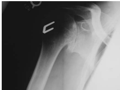
Fig. 2. Patient developed glenohumeral osteoarthritis after previous treatment for shoulder instability.

Patients have been known to develop osteoarthritis in both the early and late postoperative periods following surgical treatment for instability [29]. Early postoperative osteoarthritis is often related to hardware [28]. In the series presented by Zuckerman and Matsen, 21 out of 37 patients who developed arthritis of the shoulder were noted to have an instability repair using screws, and an additional 14 patients had undergone instability surgery using staples. Problems developed even in some patients with properly positioned hardware. Metal hardware may break or migrate [30], and thus contribute to osteoarthritic changes (Fig. 3). Early postoperative osteoarthritis ultimately resulting in total shoulder arthroplasty has also been seen after intraarticular extension of a pos-